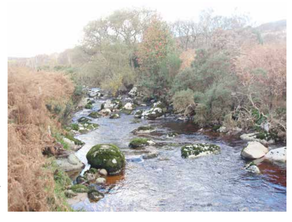
Photo 1 It is almost certain that upland marginal river catchments, such as the Glencree Valley in Co. Wicklow, were clothed in native woodland for centuries. Today, only small sparse pockets of native woodland remain within these landscapes.

The Woodlands of Ireland (WoI) project, comprising interested native woodland stakeholders, is an initiative established in 1998 to address the sustainable management and expansion of native woodland. By working closely in partnership with other professional organisations, statutory agencies and individuals, the organisation has been to the forefront in the initiation and development