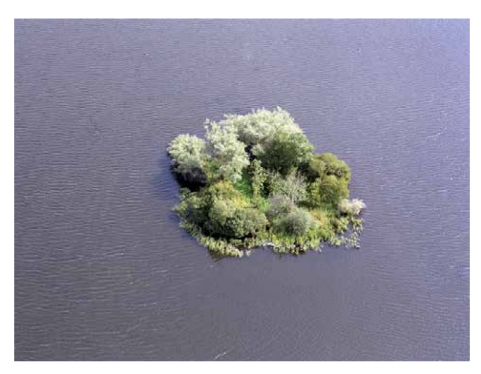
Photo 2 People and landscape: Diverse native woodland on a small lake island, previously a crannóg in pre-Christian times. Loughtown Lough, Lisdromarea, Co. Leitrim.

During the period 2000 to date, approximately