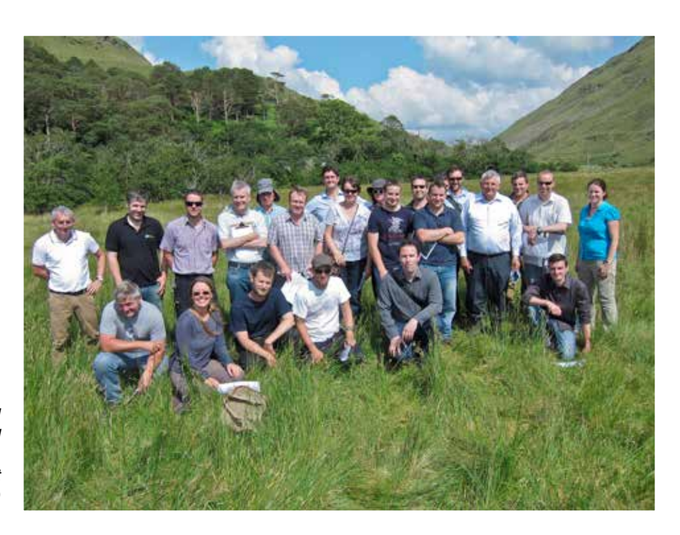
Photo 5 Participants at a joint Wol and Forest Service Native Woodland Scheme training day in 2013, Delphi, Leenane, Co. Mayo.