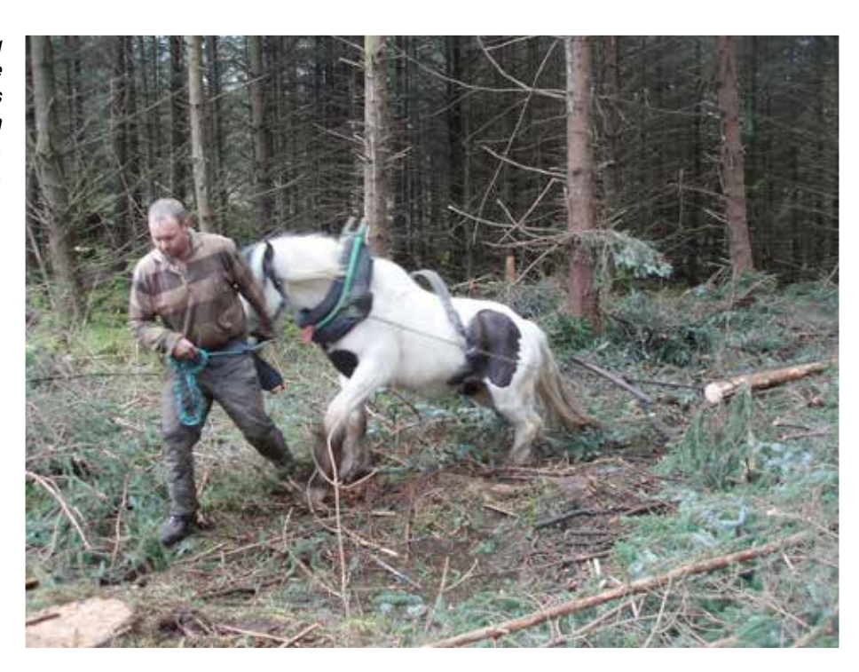
Photo 4 Sensitive timber harvesting (manual / chainsaw felling) and horse extraction close to an upland stream as part of a research project on riparian zone management, Donard, Co. Wicklow.

also on avoiding potentially negative factors, such as over-shading, potential siltation, the spread of invasive species, and risks associated with windblown trees in riparian zones.