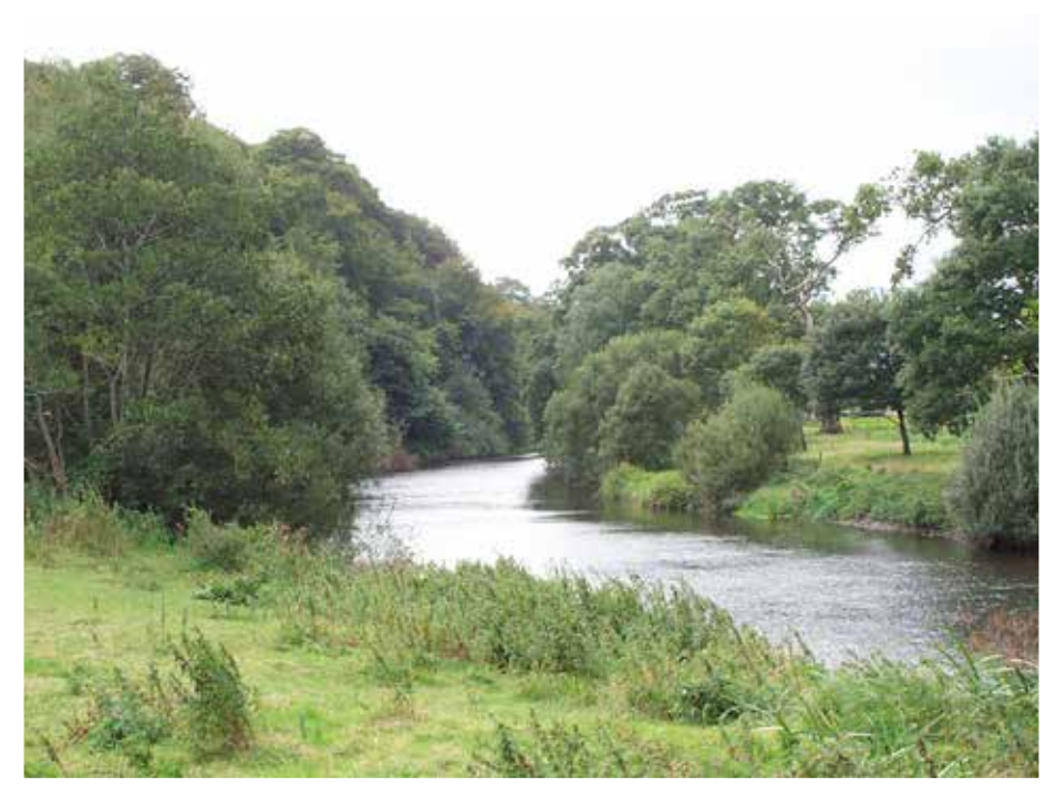
Photo 7 Riparian native woodland, Bandon, Co. Cork. Such woodlands buffer watercourses from sediment and nutrient runoff from surrounding landuses, retain flood water, and represent an ecologically important but highly threatened and rare component of our inland waters.