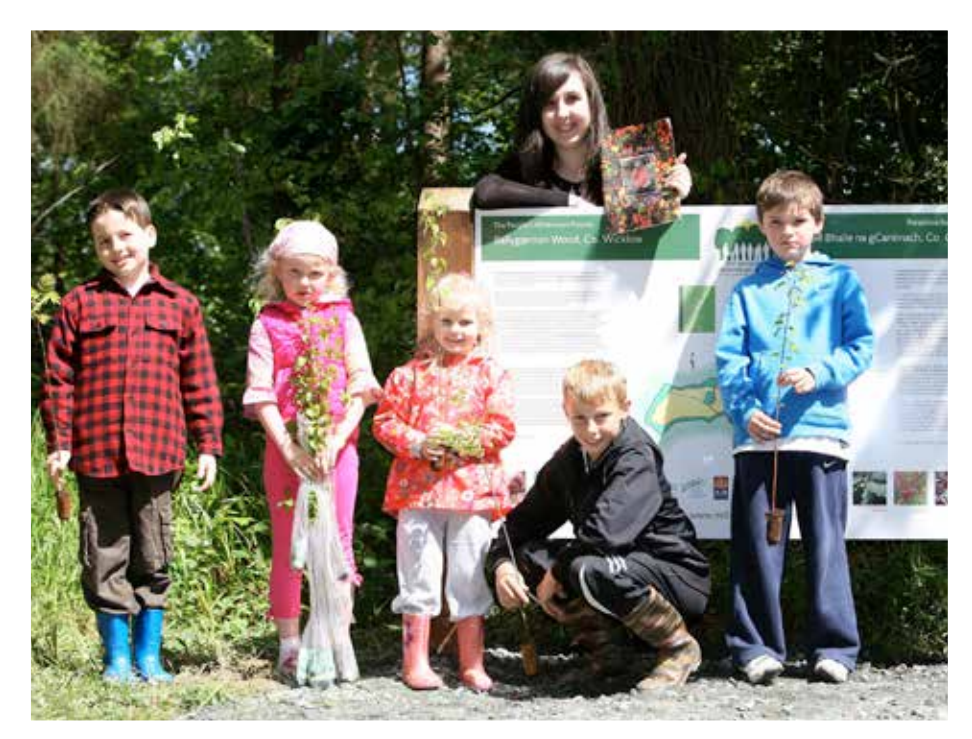
Photo 3 The relaunch of the People's Millennium Forests Project in 2011 at Ballygannon Wood, Rathdrum, Co. Wicklow. This flagship native woodland project is the biggest in this sector to date and has promoted native woodlands widely amongst the general public.