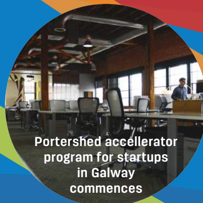
Portershed accelerator program for startups in Galway commences