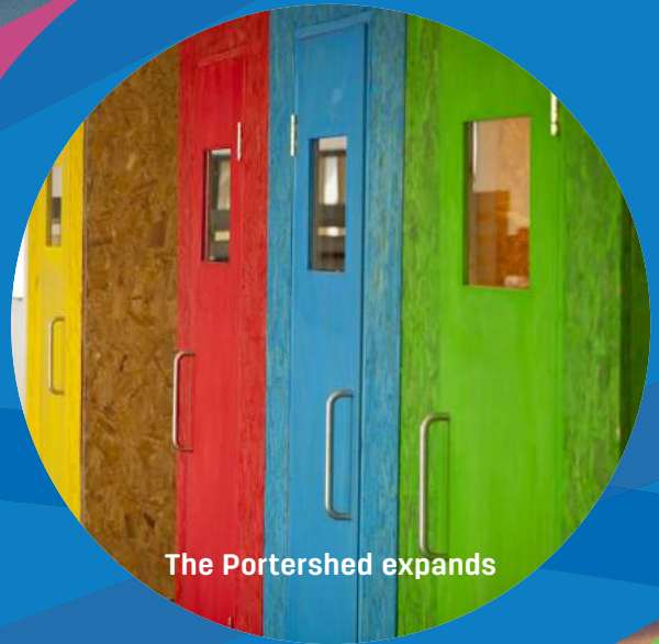
The Portershed expands

Galway City is 1st in Ireland for science, technology, engineering and mathematic-related (STEM) graduates in the labour force and 2nd in terms of third-level graduates