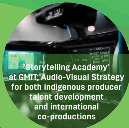
'Storytelling Academy' at GMIT; Audio-Visual Strategy for both indigenous producer talent development and international co-productions

Plans for a network of Creative Enterprise centres, with strong deep roots in to the Creative Hub and community in GMIT, fits perfectly as a part of the regional Innovation Network and Foundry concept. Functioning networks of practice (together with international markets) are critical to the continued growth of the creative sector.