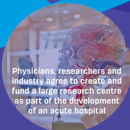
Physicians, researchers and industry agree to create and fund a large research centre as part of the development of an acute hospital

UNESCO 'Creative Cities' International Conference on 'Creativity & Sustainable Development'