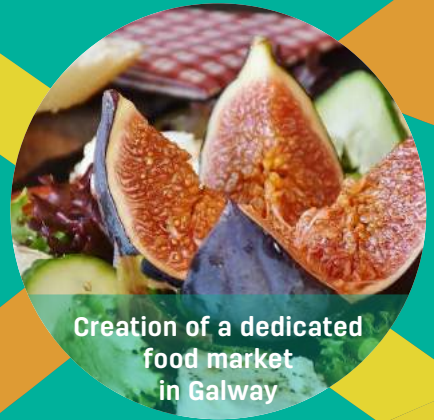
Creation of a dedicated food market in Galway

Galway City is 1st in Ireland for science, technology, engineering and mathematic-related (STEM) graduates in the labour force and 2nd in terms of third-level graduates