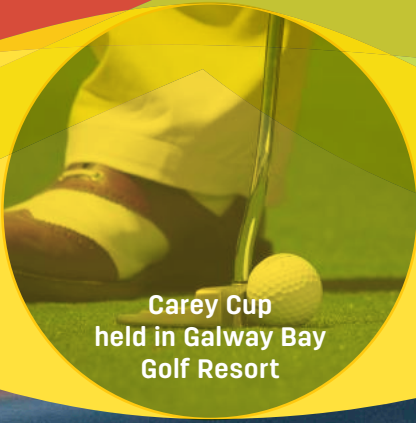
Carey Cup held in Galway Bay Golf Resort

'Galway School of Design & Creative Arts' at GMIT Wellpark campus; Virtual Reality Innovation Centre