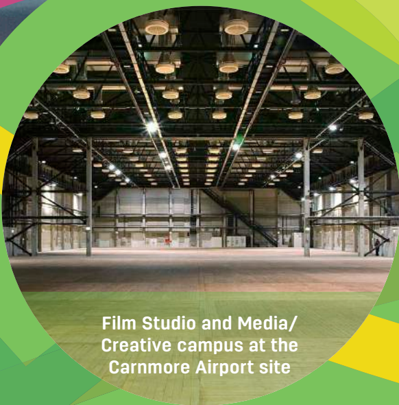
Film Studio and Media/ Creative campus at the Carmore Airport site