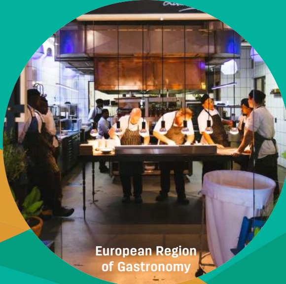
European Region of Gastronomy

Development of 'Creative Teachers' programme for Child and Youth Educators