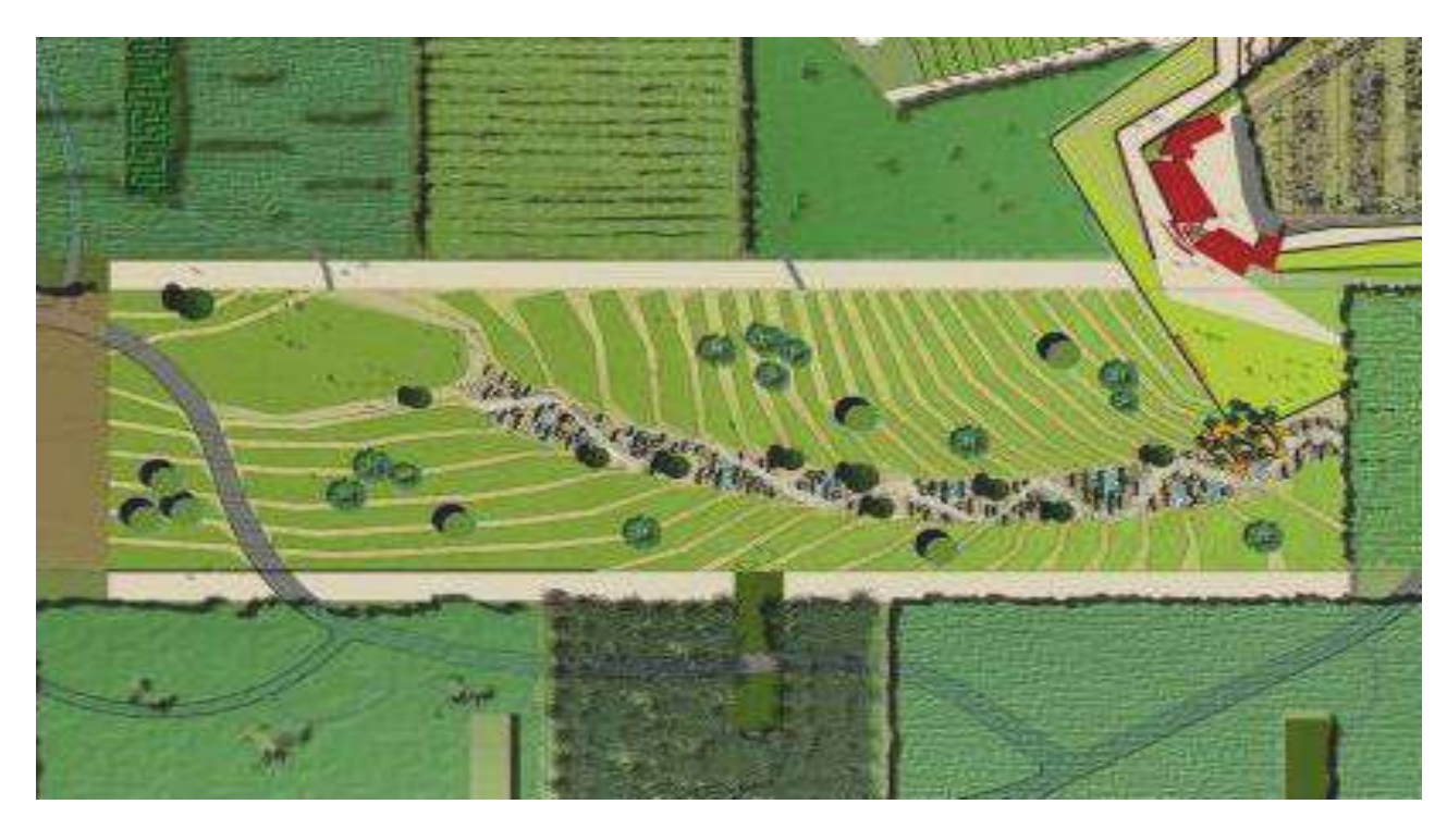
SUBMISSION TO DEPARTMENT OF HOUSING, PLANNING, COMMUNITY & LOCAL GOVERNMENT