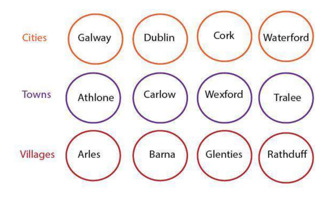
Figure 1: New graded system to help organise Ireland properly.

This list should be done county by county including the north of Ireland. In all of these places we should look at education, government investment and many other key areas of growth and employment. If we don't examine every single thing from the smallest village up then we don't know what we're dealing with and if we don't know what we're dealing with then were not in control and certainly not running the country effectively.