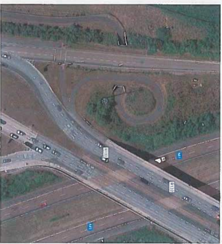
Existing Cycling Underpass Swords Roundabout