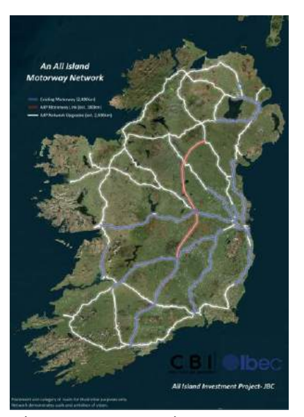
Figure 1. Current Motorway Network and A Vision for an All Island Motorway Network.

The JBC comments, observations and suggestions set out in this submission on this key transport challenge along with the implementation and coordination of almost every National Policy Objective (NPO) with an all island dimension should begin now (eg to improve road connections to border counties in the North West region of the island before the (re)imposition of a visible border).