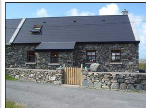
Renovated Cottage in Inishbofin

• Grant aid should be provided for the renovation of old houses for use as homes.