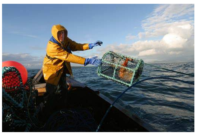
Shooting pots, Inisturk

Island identity is inevitably bound up with the sea, with sea-faring and fishing and the income from fishing has been an important part of the economies of the islands. It is also an important part of living island heritage. Threats to fishing livelihoods impact particularly severely on island communities who have few other choices in terms of employment or income generation. The one fits all approach taken in EU and national fisheries legislation is inappropriate for small scale island fisheries.