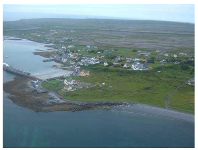
Aerial View of Árainn (Inis Mór)

Housing and planning issues on the islands should be governed by the principle of facilitating islanders to remain on the island, while protecting the environment and preventing over development. Islanders must be consulted and their concerns incorporated into local authority planning policies.