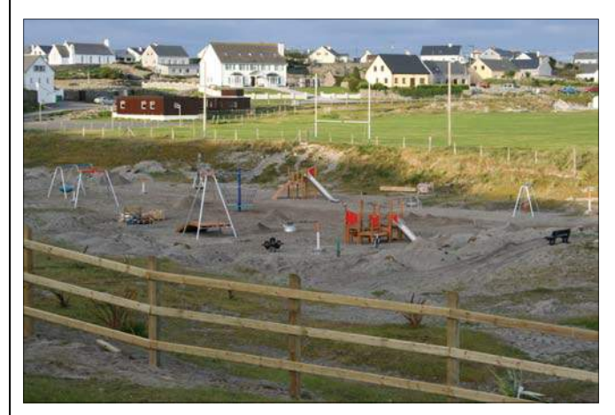
New Playground in Inis Oírr

• Childcare provision to be part of island development plans.