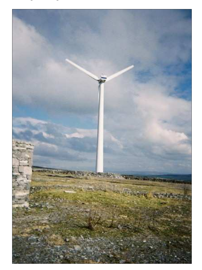
Windmill in Inis Meáin

• Island communities should be supported by the relevant statutory agencies in developing and enhancing their outdoor public spaces.