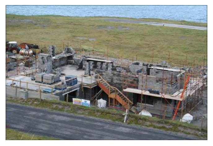
New health centre being built on Inis Oírr

• The additional cost for islanders of availing of particular services (eg Maternity Services) located in cities/towns should be reimbursed by the HSE.