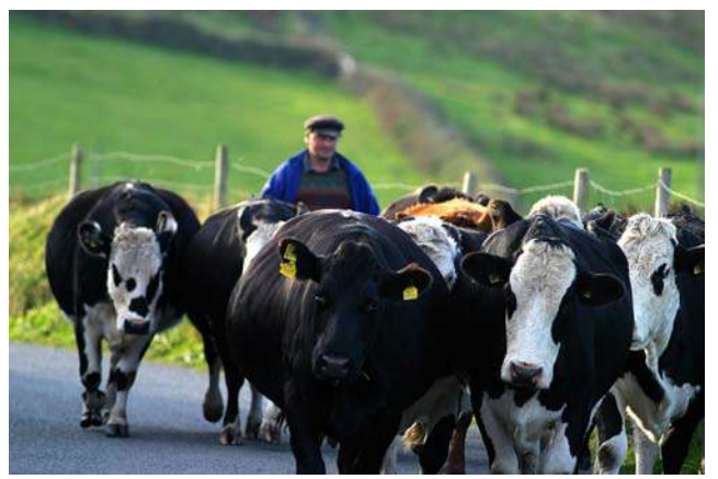
Driving cattle on Dursey Island

Many islanders of necessity rely on a number of parttime and/or seasonal jobs in order to sustain their livelihood. Unlike their colleagues on the mainland, island farmers have few opportunities to take up alternative forms of employment. Farming also costs more on the islands: VAT is effectively paid twice, as it is levied on goods at the point of purchase and also on the freight coming into the island; there is also the added cost of taking animals to markets, including sometimes having to house them overnight on the mainland; the cost of veterinary care is also considerably higher.