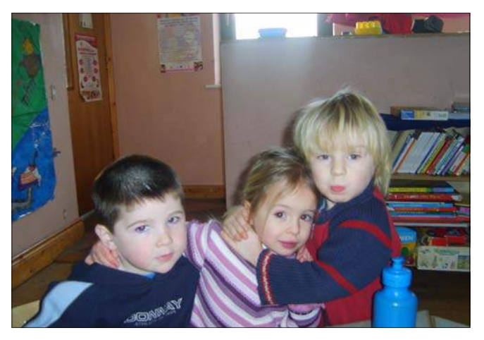
Little Angels Creche in Clare Island

The provision of childcare on the islands presents particular challenges which require innovative and flexible responses from funding agencies and service providers.