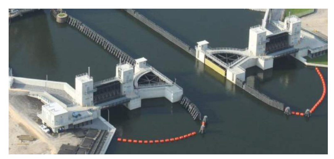
Figure 4.1: Example of sector gates and sluice gates (New Orleans)

Figure 4.1 shows an example of sector gates combined with sluice gates. The Cork tidal barrier would be a low level structure where the lifting gates would not rise above the crest level of the embankment. These gates are not navigation openings and a low level profile would be achieved by dividing each gate into two overlapping segments. Further information on gate types is given in Appendix A.