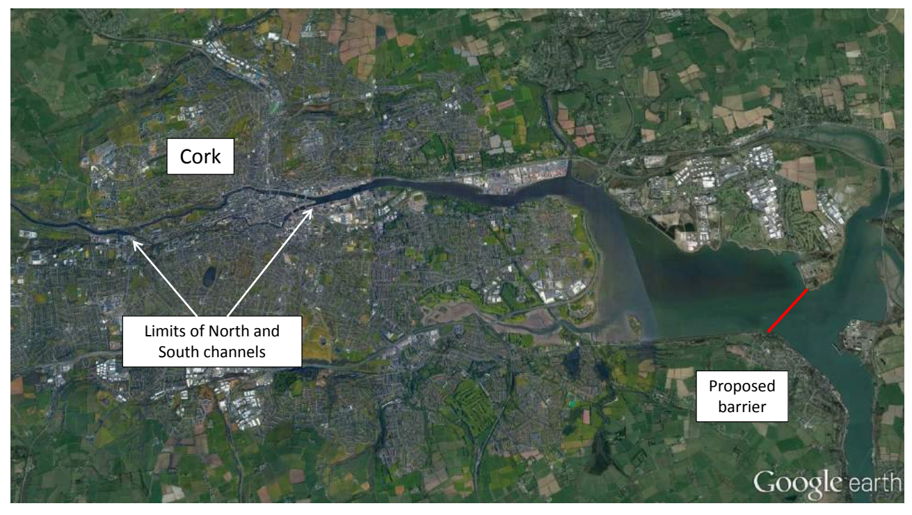
Figure 2.1: Location of the proposed barrier