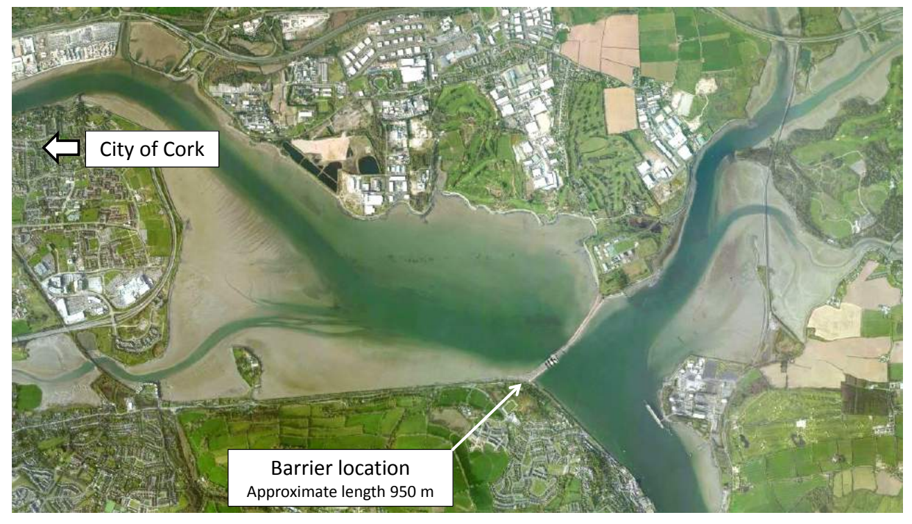
Figure 2.2: Proposed barrier at low tide