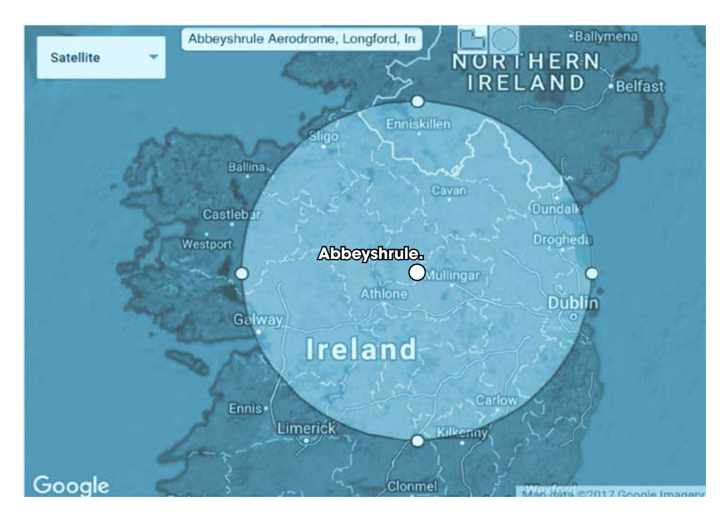
Population catchment area within 90 mins car journey time. 2,275,406.

The upgrade of the existing runway and airport infrastructure at Abbeyshrule would offer a low cost and accelerated solution to the current capacity crisis facing Ireland's densest population area. The positive economic effects would be seen across the local and national economy: