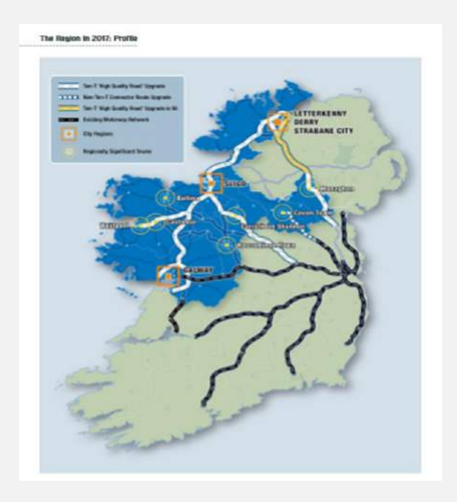
Map: Priority Road Projects in the NWRA.

(b) Prioritise investment in the Electricity Grid Network and Road Infrastructure to a Ten-T 'High Quality Road Standard' to the Northern and Western region, thus providing lifeline routes to rural communities, enabling access to essential goods and services, such as education, healthcare and employment that are necessary to sustain rural communities.