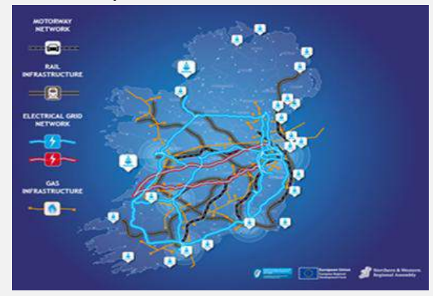
Figure: Layers of Infrastructure, motorway extensions

The gap is widening and without appropriate intervention presents a threat of greater uneven regional development. The economic underperformance could arguably be explained by the endemic lack of infrastructure in the region, which a potential gamechanger like the NPF could and should mitigate (See Figure below and the NWRA submission to the NPF Issues and Choices consultation).